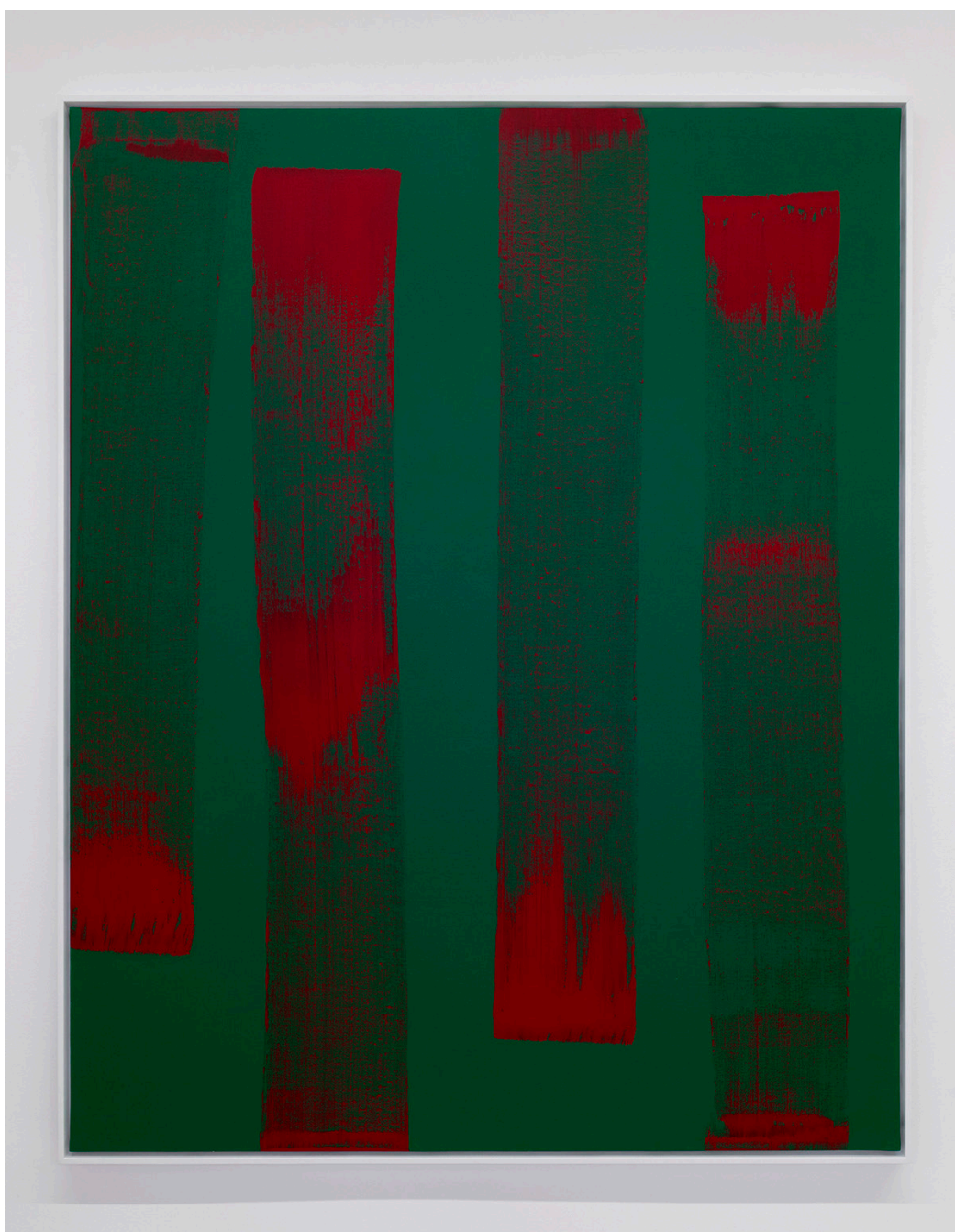
Concorde 3 2023 Acrylic on canvas 162 × 130 cm