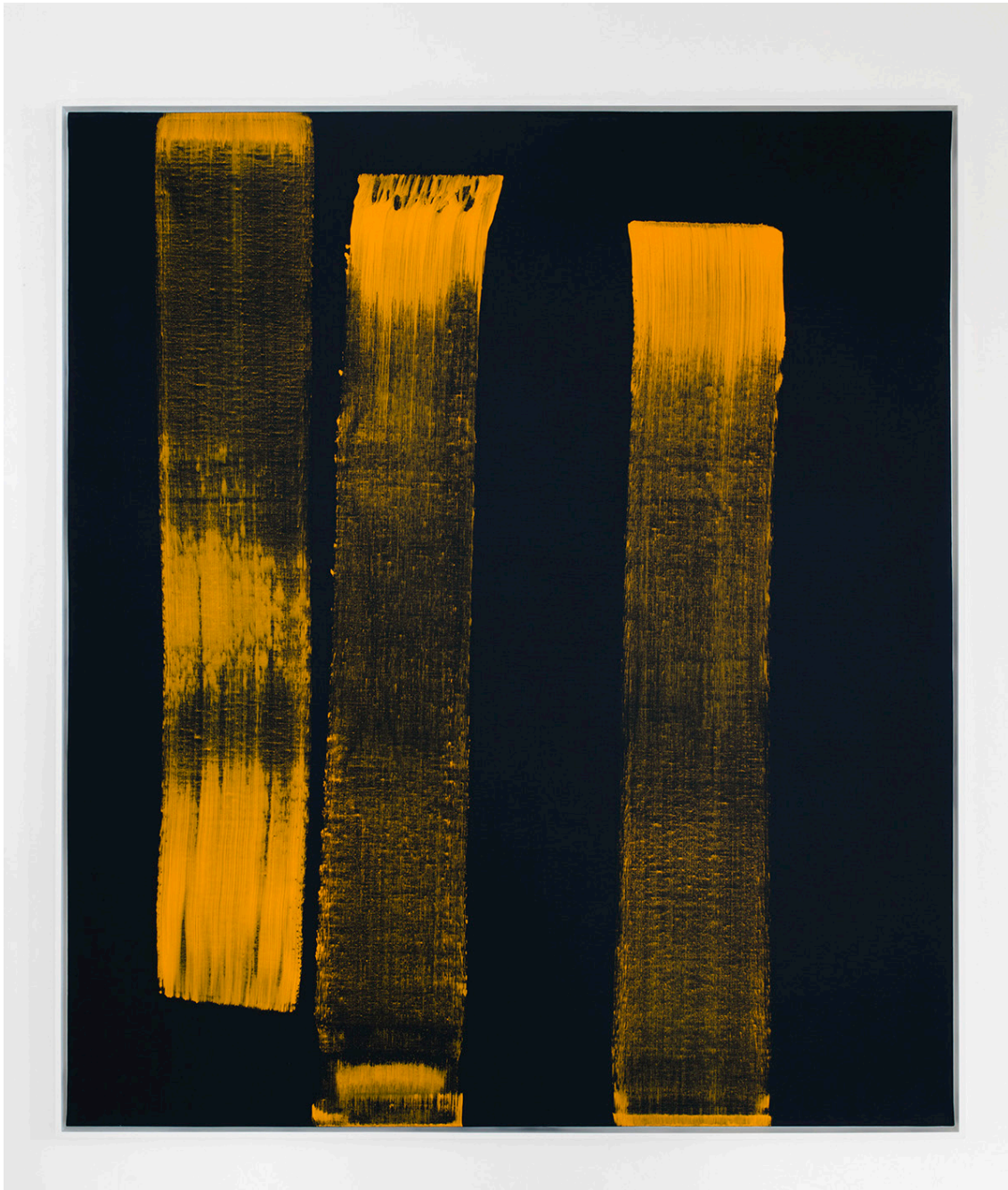
Concorde 2 2023 Acrylic on canvas 160 × 140 cm