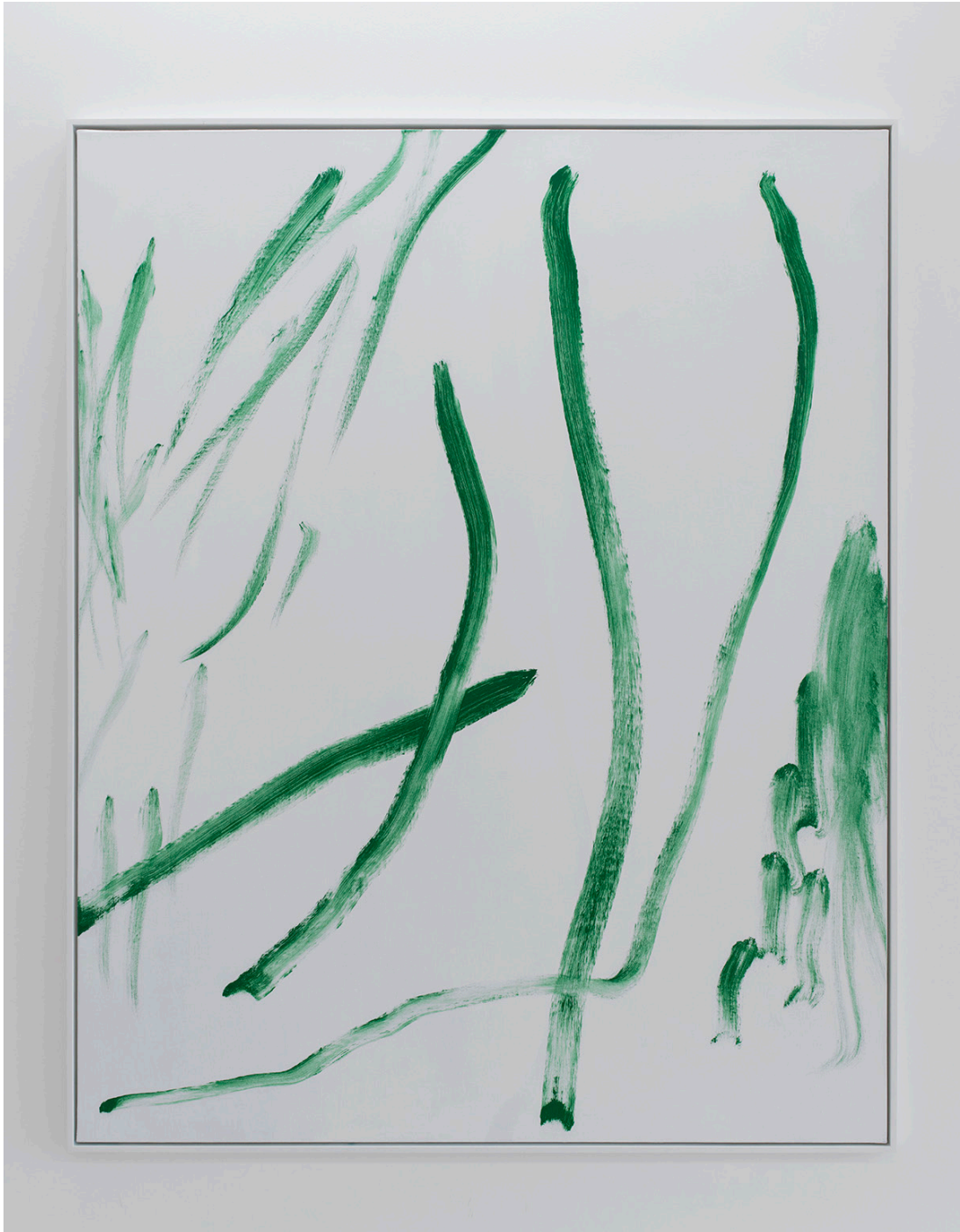
Ixelles 3 2023 Acrylic on canvas 162 × 130 cm