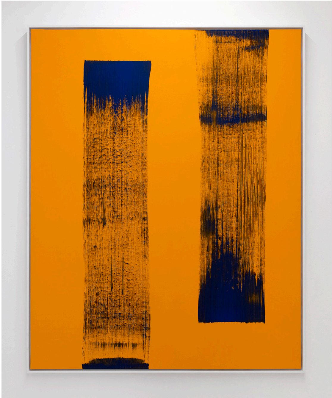
Concorde 4 2023 Acrylic on canvas 162 × 130 cm