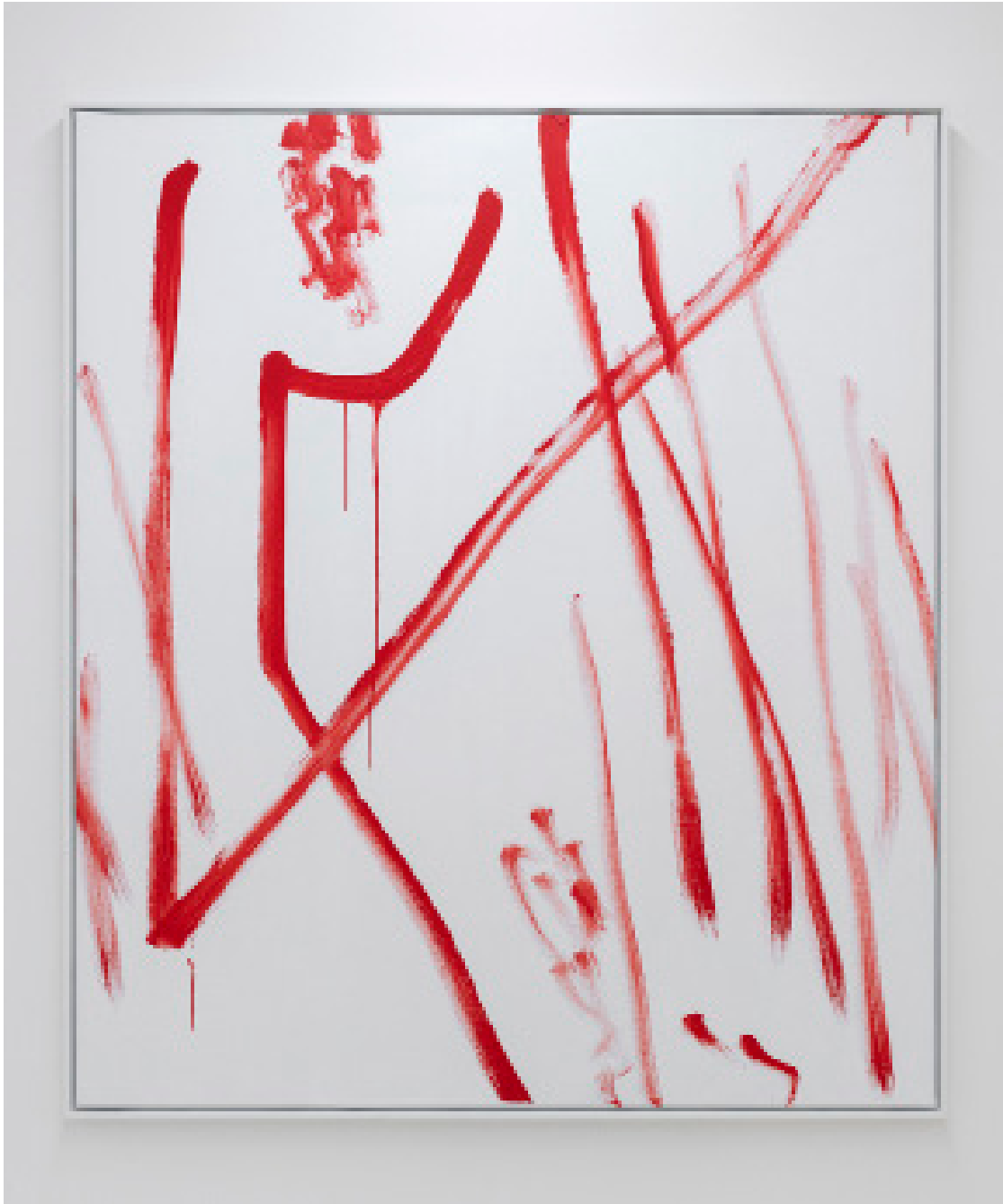
Ixelles 2 2023 Acrylic on canvas 160 × 140 cm