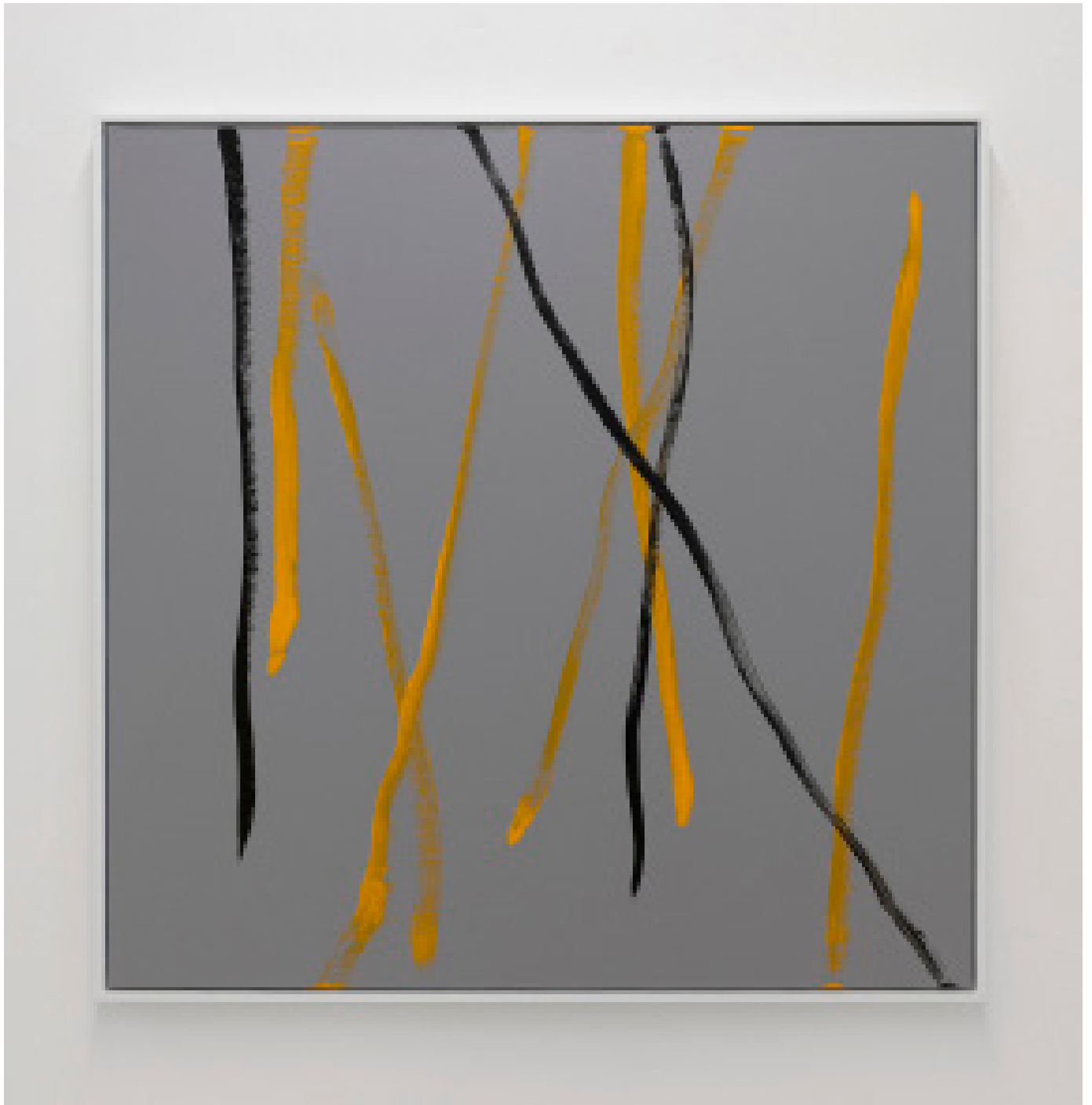
Ixelles 4 2023 Acrylic on canvas 100 × 100 cm