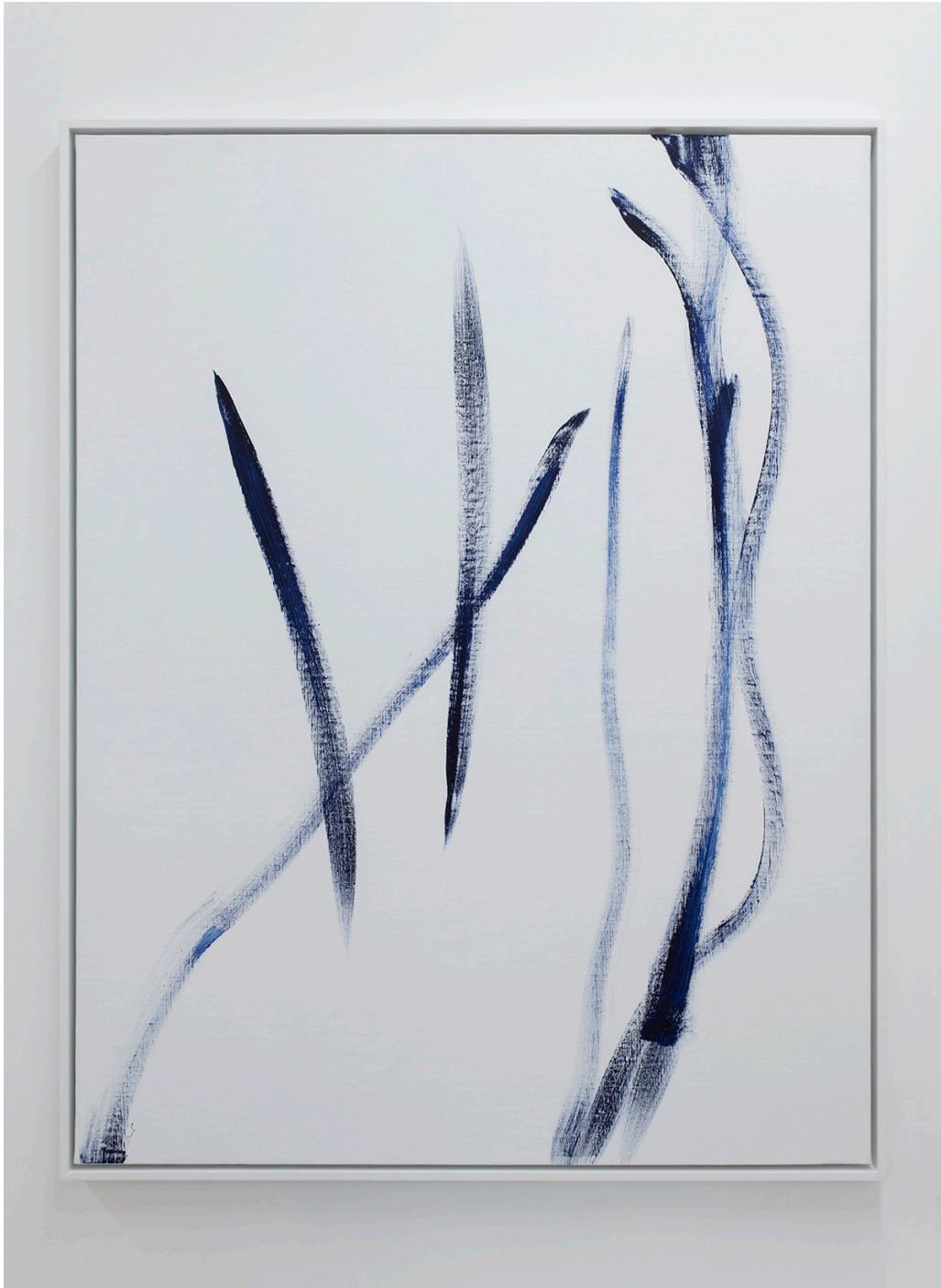
Ixelles 4 2023 Acrylic on canvas 116 × 89 cm