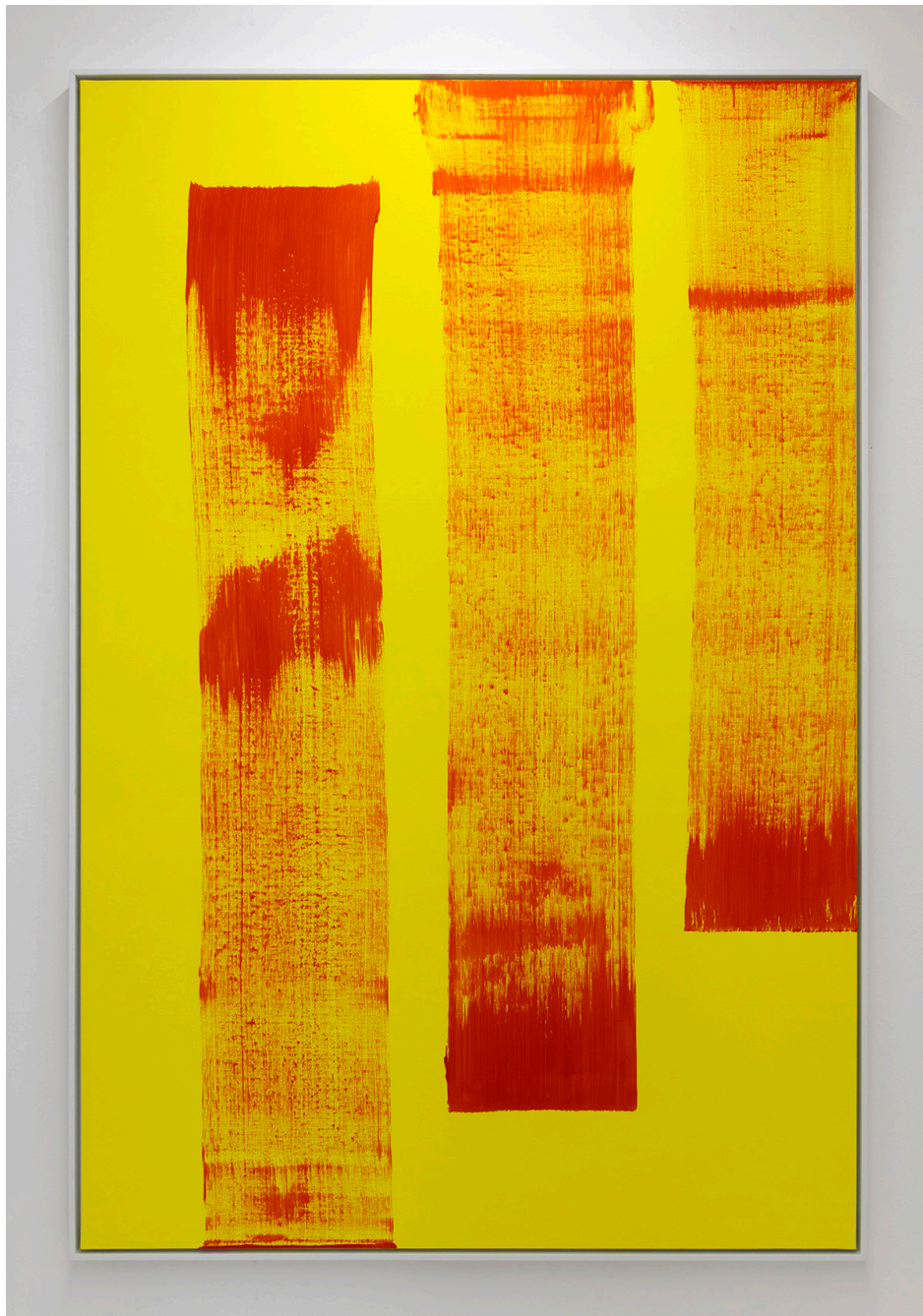
Concorde 4 2023 Acrylic on canvas 162 × 130 cm